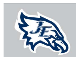
White & Navy on Light Gray